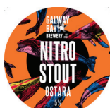
Ostara Nitro Stout