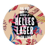
Slow Lives Helles Lager