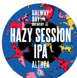
Althea Hazy Session IPA