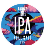
Full Sail West Coast IPA