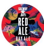
Bay Ale Red Ale