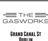
GRAND CANAL ST DUBLIN